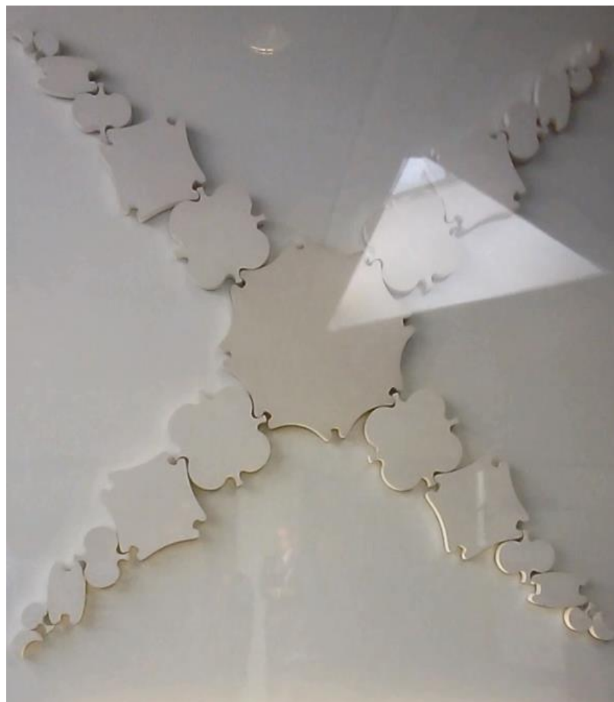
Art installation @ the Chamber of Industry and Commerce in the city of Arnsberg